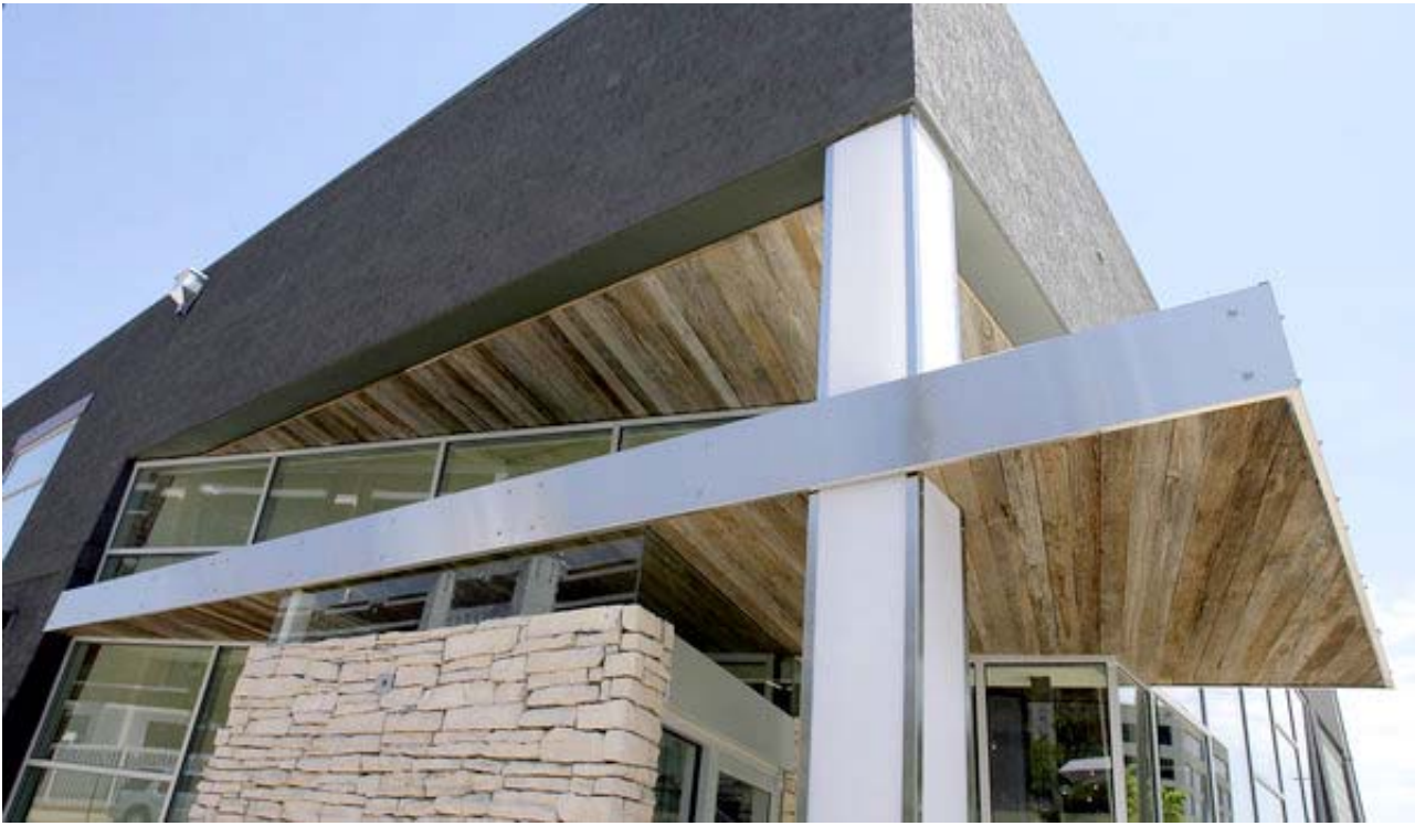
The main entrance of the law firm of Smolen and Smolen shows interesting details in the renovated Ridgeway Building at Seventh Street and Cincinnati Avenue.